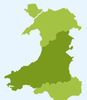
Dafydd Llywelyn Police and Crime Commissioner for Dyfed-Powys

These achievements should provide you with reassurances that while the financial landscape will continue to be both unpredictable and challenging over the next year, both the Chief Constable and my priorities will remain to keep people safe from harm, protect victims and the vulnerable, and improve confidence in policing and our criminal justice system.