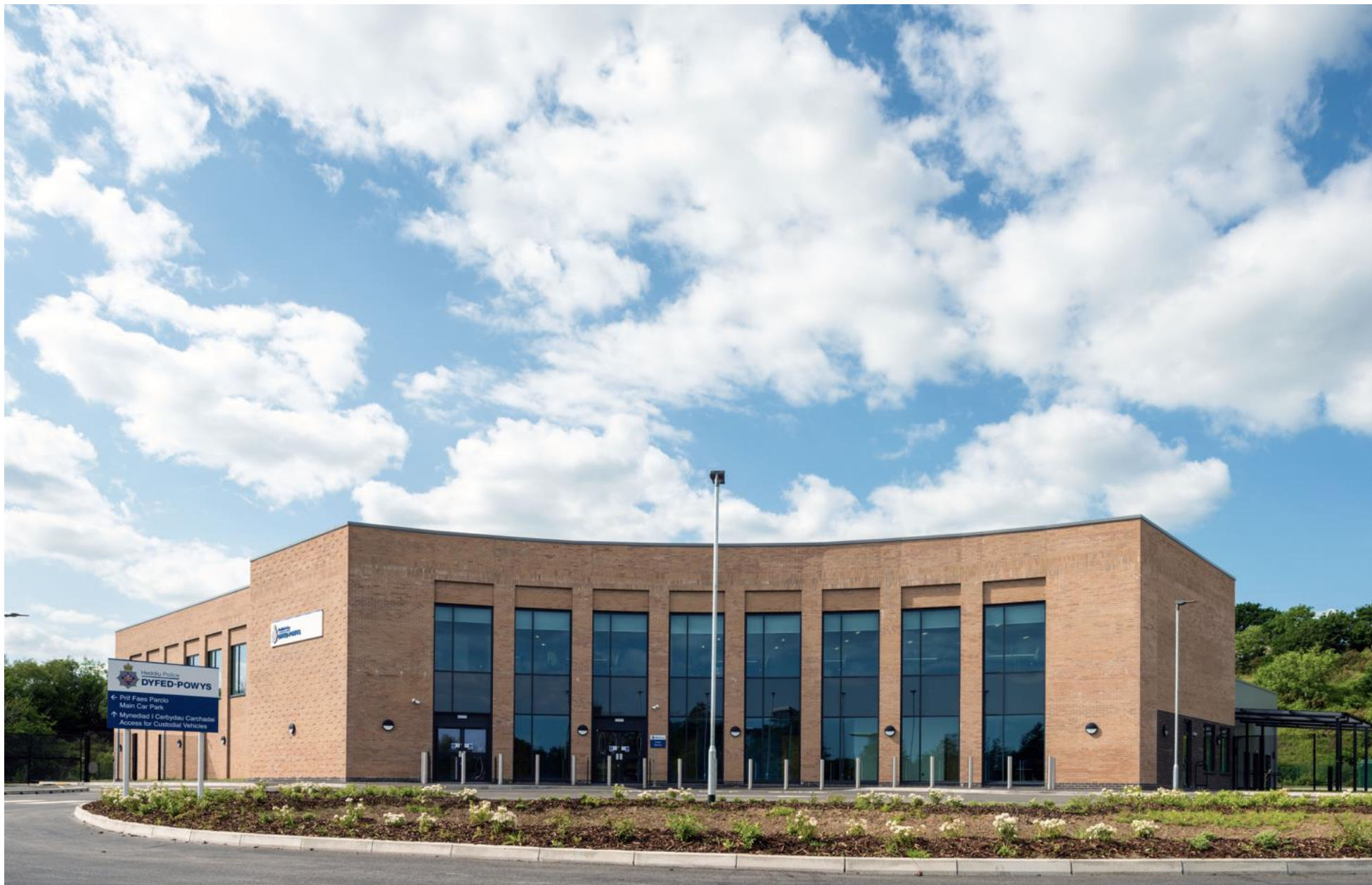
WCCTV Time Lapse Production: Wilmott Dixon Construction Ltd - Heol Aur Dafen